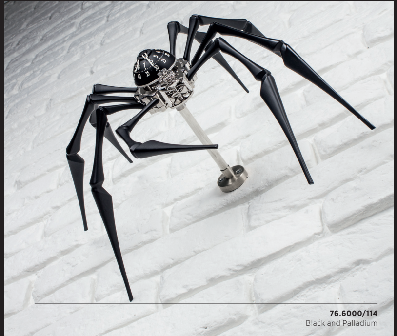
76.6000/114 Black and Palladium